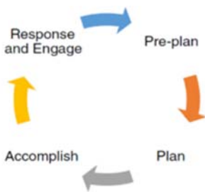
Fig. 1 The four phases of the conference/meeting cycling